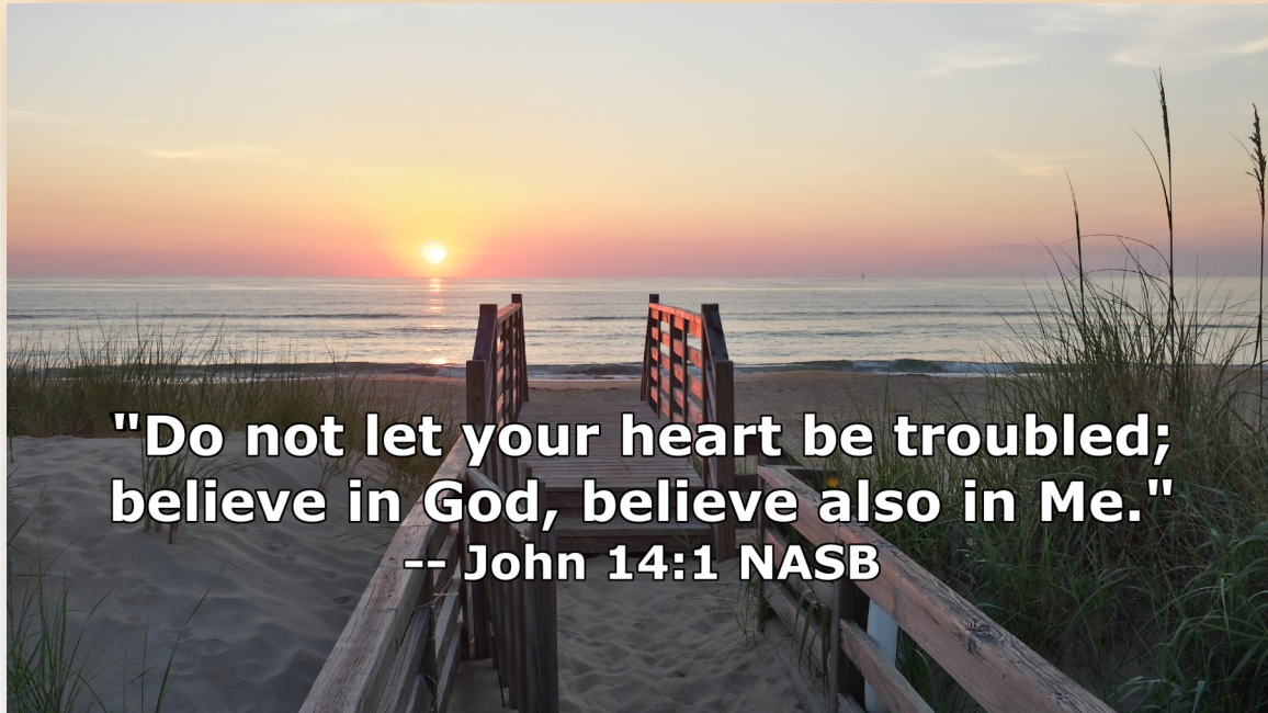
Nags Head Sunrise with John 14:1

“Do not let your heart be troubled; believe in God, believe also in Me.” (John 14:1)