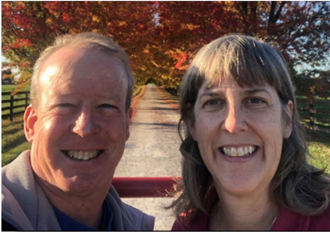
The Henrys serving in Turkey